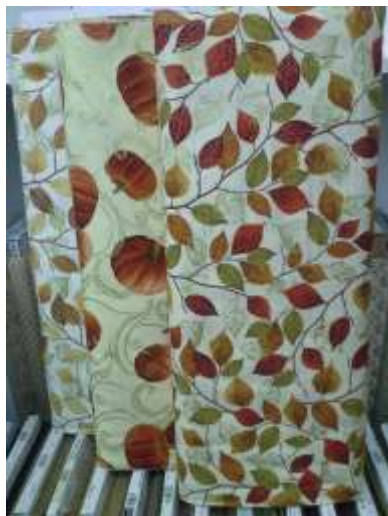
Home for the Holidays by Red Rooster