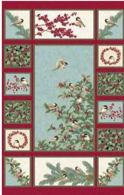
Santa Coming to Town by Quilting Treasures