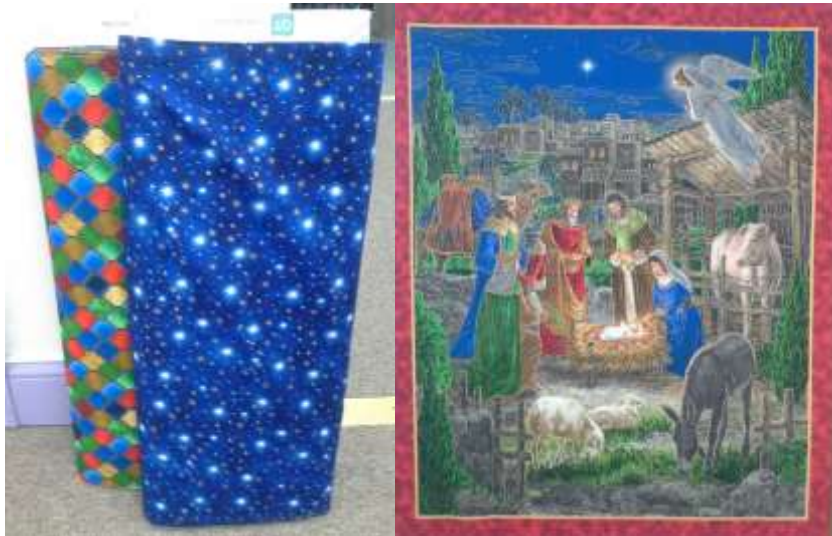
Best Time of the Year by Quilting Treasures