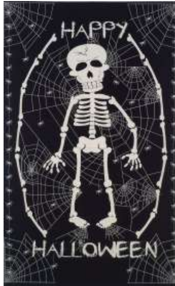
Autumn Splendor by Kansas