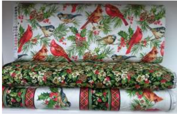
Holy Gathering by Quilting Treasures