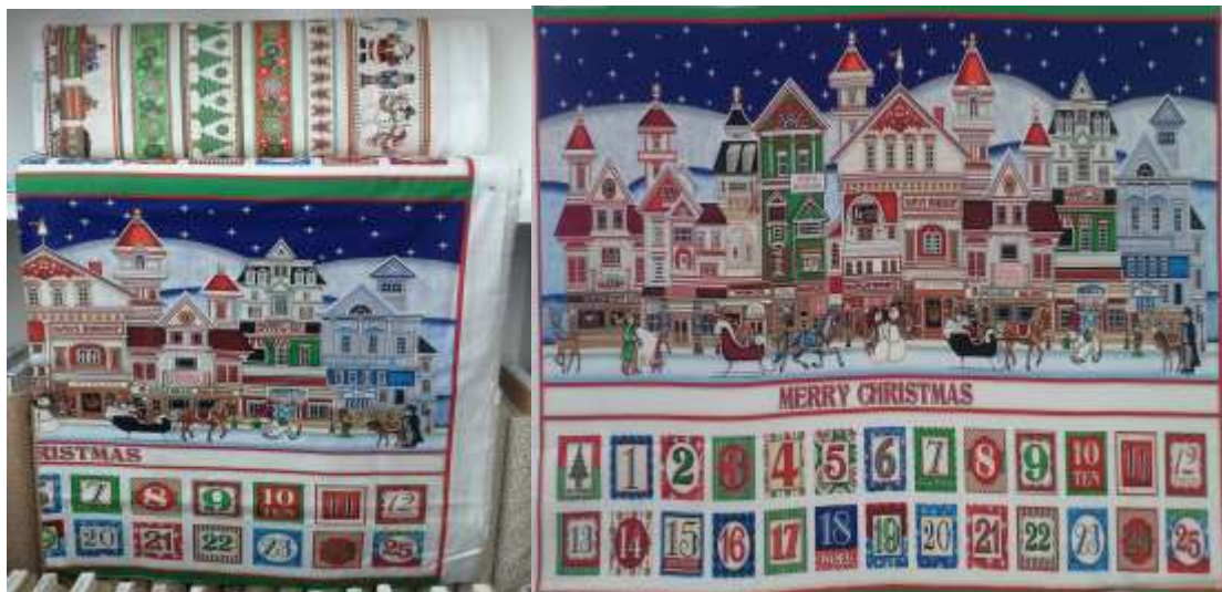
Home for the Holiday by Northcott