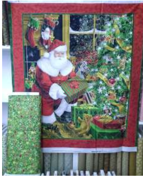
Winter Bliss by Studio E